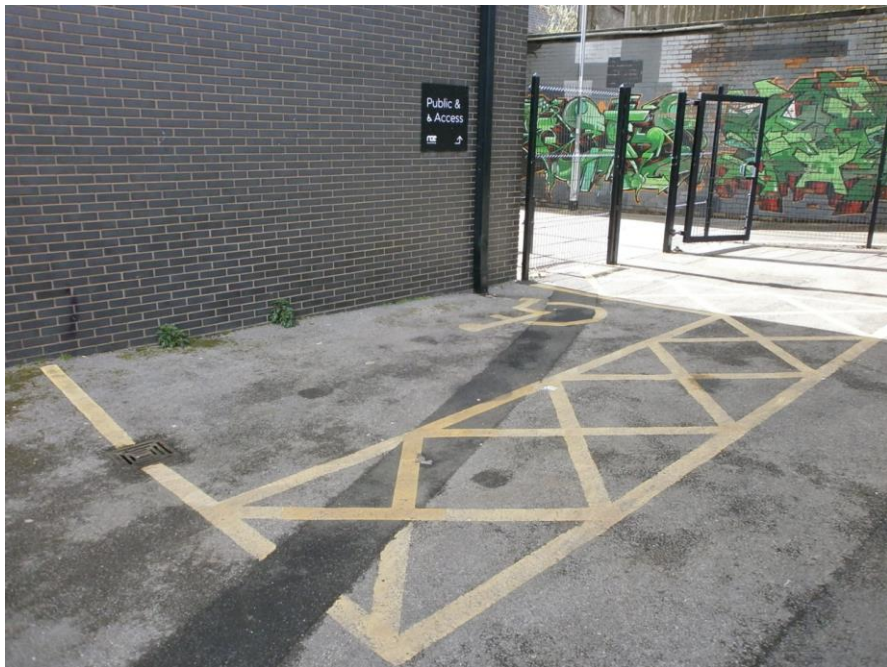
NAE has 2 Blue Badge parking spaces at the rear of the building, just off Terrace Street (NG7 6ER). The area is well lit during darkness hours.