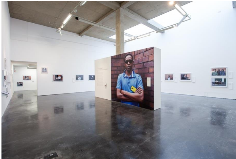
The Main Gallery

The exhibitions in the main, mezzanine and central galleries vary with up to 4 different exhibitions in each space annually. On occasion temporary walls are added and lighting settings are altered. The exhibition designs always allow enough space for wheelchairs to navigate. If the gallery is darkened (during film/video installations) lit emergency exit signs are used