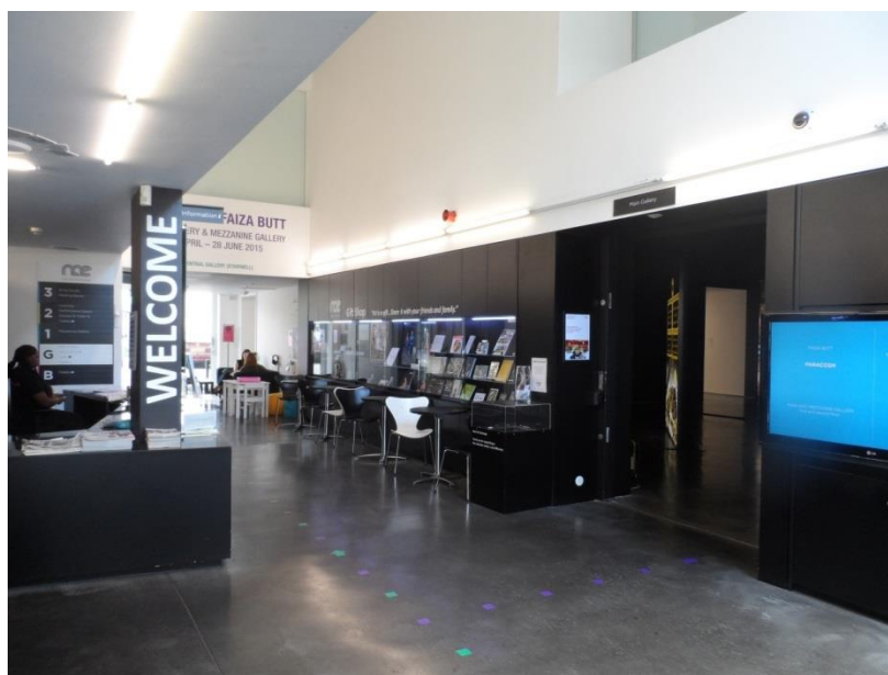
Ground Floor Entrance area

The ground floor has an open plan design, making it easy to access the café, reception and main gallery.