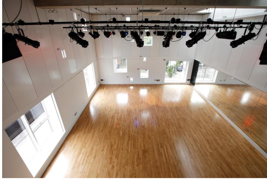
The Performance Space

The performance space and learning room are sited on this floor. A hearing loop system is installed in the performance space.