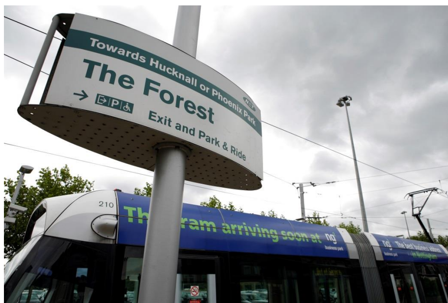
The Forest Tram Stop

Meet and greet is available for guests and groups. Please inform NAE day and time of arrival and we will ensure a staff member is available to meet you.