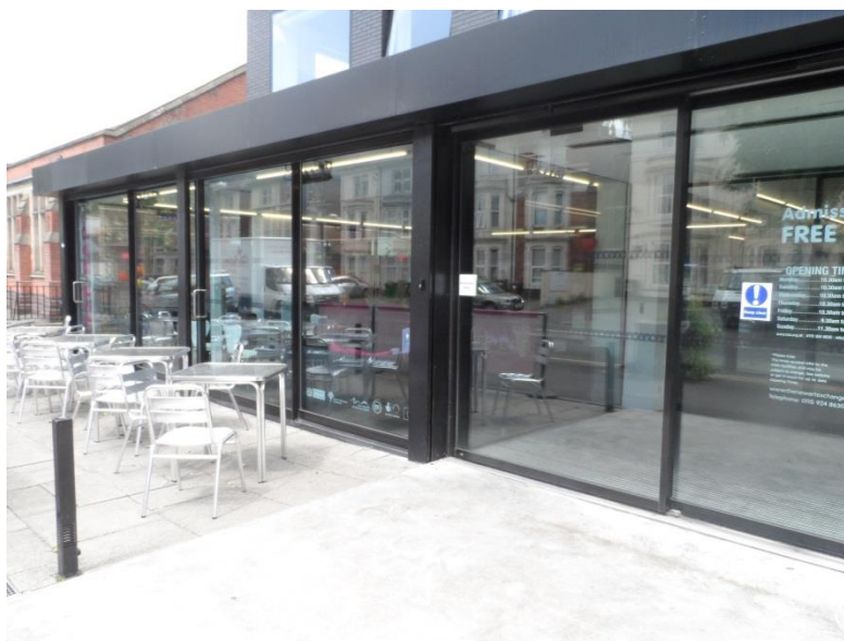
(Main Entrance with Automatic Doors)

The ground floor has an open plan design, making it easy to access the café, reception and main gallery.