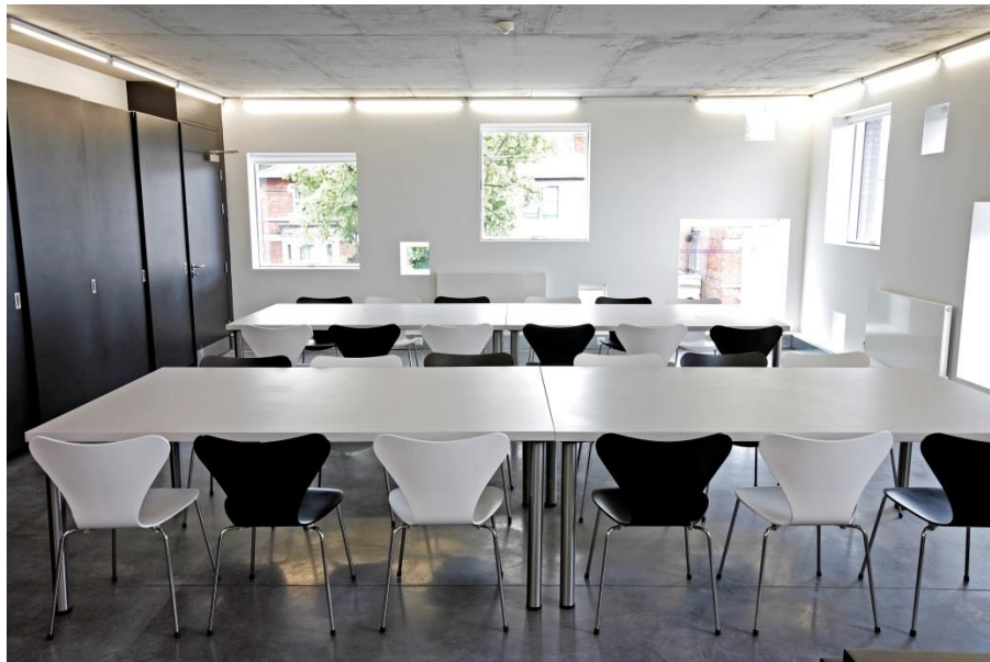
The Learning Room