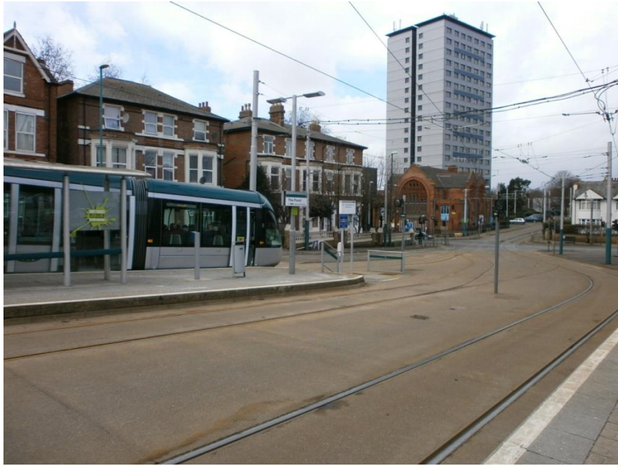
The Forest Tram Stop – NAE is to the left of the High Rise Flats on Gregory Boulevard