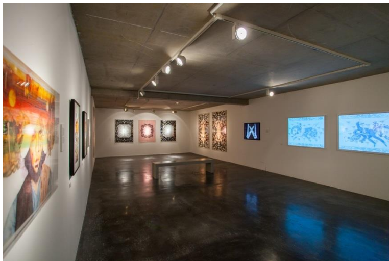
The Mezzanine Gallery

Access to the first floor is via the main passenger lift or stairs. The mezzanine gallery is sited on this floor. Full access is available for wheelchair users.