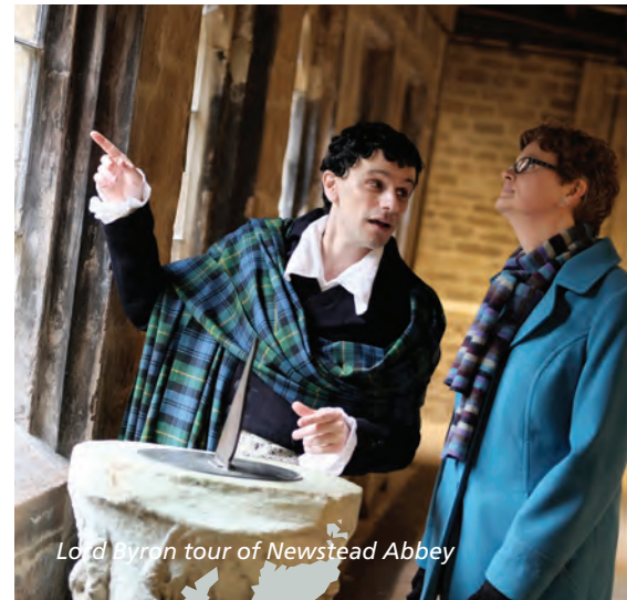
Lord Byron tour of Newstead Abbey