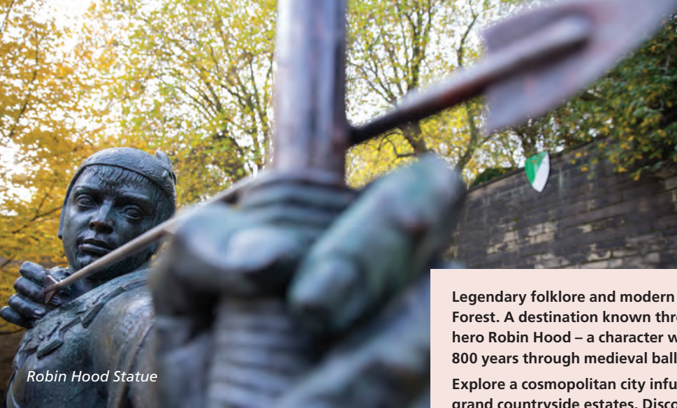
Robin Hood Statue

Legendary folklore and modern charm collide in Nottingham and Sherwood Forest. A destination known throughout the world as the home of outlaw hero Robin Hood – a character whose well-loved tale has been retold over 800 years through medieval ballads, literature, television, film and theatre.