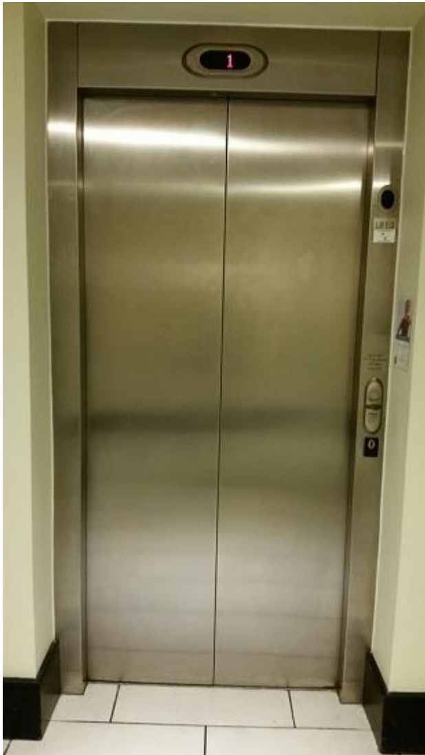
Leisure Club lift