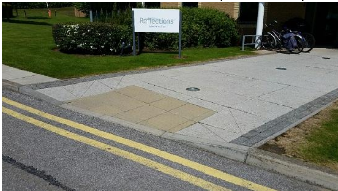
Dropped curb & drop off at Reflections Leisure