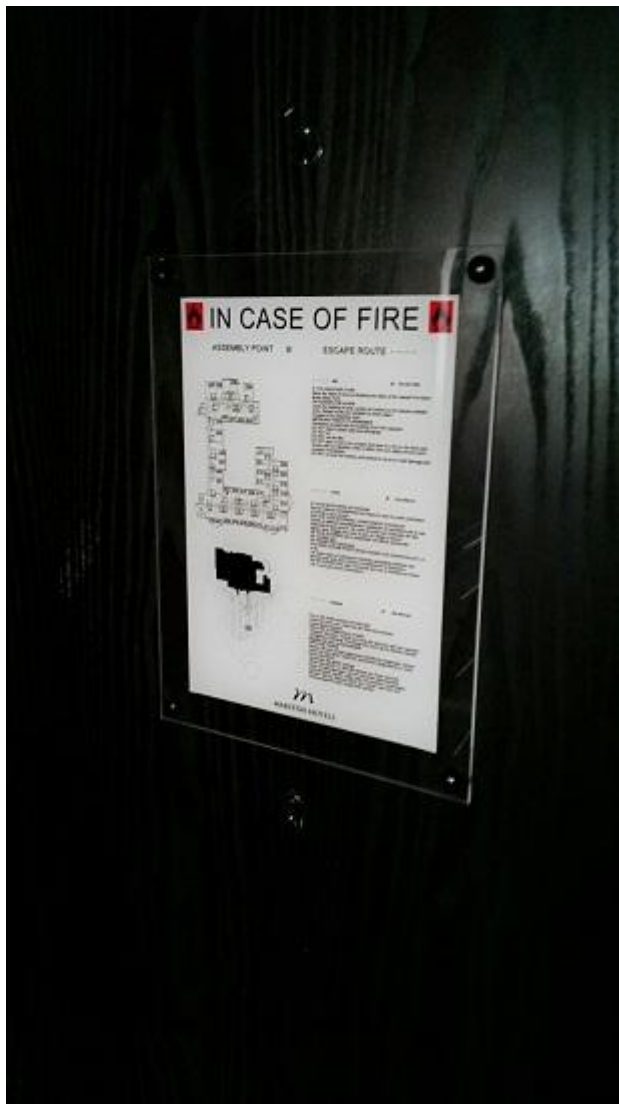
Fire Evacuation Notice