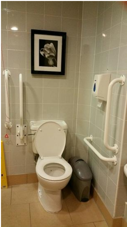
Leisure Club accessible changing facilities & toilet