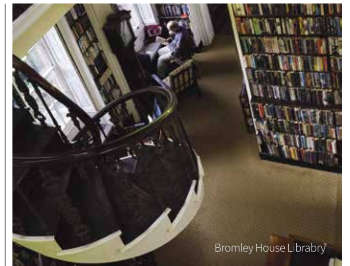
Bromley House Library

Bromley House Library - Hidden away in the heart of Nottingham city centre is a beautiful 200-year old library with around 40,000 books spread over three floors of a Grade II listed Georgian Townhouse. Open to the public on selected days of the week, groups can pre-book a private tour or get in touch to find out when the library is open for visitors.