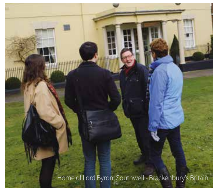
Home of Lord Byron, Southwell - Brackenbury's Britain

The literary specialist Gold Star Guides provide a 2-hour walking tour through the city centre, and the cultural specialist Brackenbury's Britain offers personalised tours which could include a visit to the home of Lord Byron.