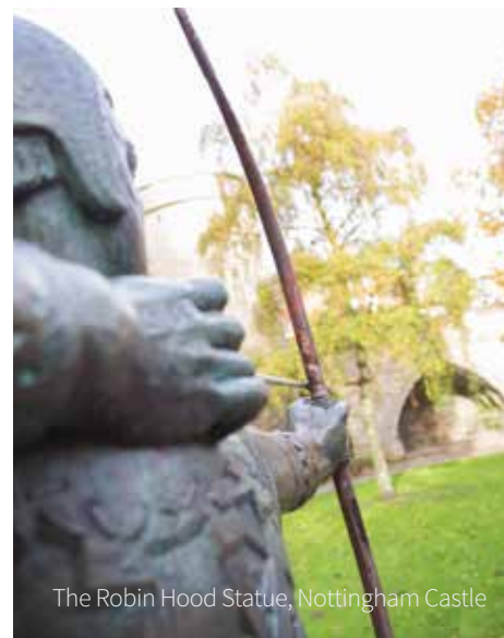
The Robin Hood Statue, Nottingham Castle

From Newstead Abbey it is only a short journey to visit the church where Lord Byron is buried. Visitors from around the world make pilgrimages here to see Byron's last resting place and learn about his life and works.