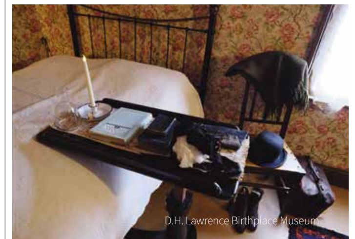
D.H. Lawrence Birthplace Museum

Bromley House Library - Hidden away in the heart of Nottingham city centre is a beautiful 200-year old library with around 40,000 books spread over three floors of a Grade II listed Georgian Townhouse. Open to the public on selected days of the week, groups can pre-book a private tour or get in touch to find out when the library is open for visitors.