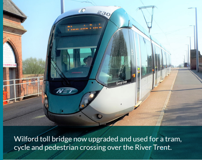
Wilford toll bridge now upgraded and used for a tram, cycle and pedestrian crossing over the River Trent.