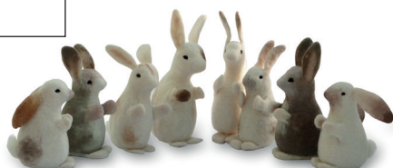
Art Felt (M17)